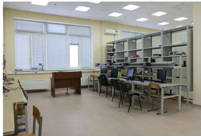
multimedia and computer rooms with the latest equipment and WI-FI