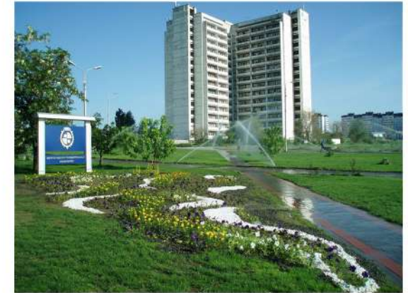
The dormitory is in 5 minutes' walk from the university