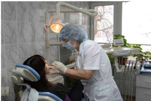
first-aid post and ambulance station(dentist, therapist)