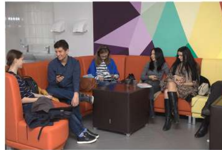
Co-working space for students