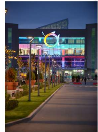
Shops and service centers are in 5 minutes' walk from the dormitory