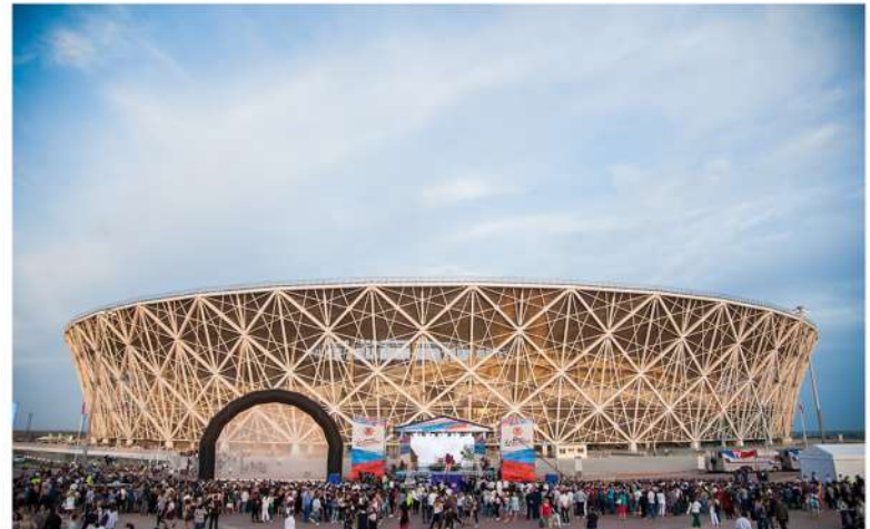
Stadium "Volgograd Arena"