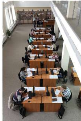
Modern and extensive library