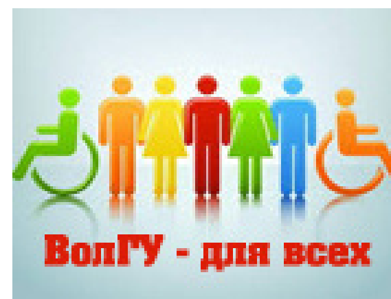
'VoISU is for everyone' poster

Students and employees of VoISU are obliged to observe the VoISU Ethics Code, which excludes any kind of discrimination and harassment.